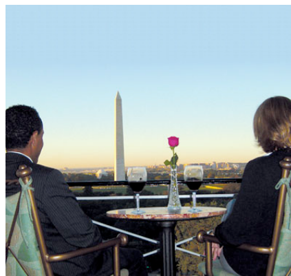
View from the Sky Terrace