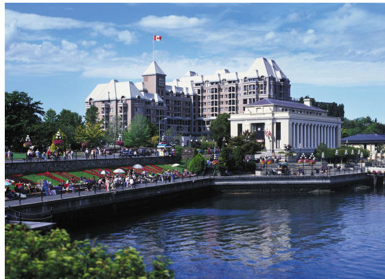
Hotel Grand Pacific (Victoria's Inner Harbour)

The Academy of Aphasia conference will be held at the Hotel Grand Pacific in beautiful Victoria, British Columbia. The Hotel Grand Pacific is located near the picturesque inner harbour at 463 Belleville Street.