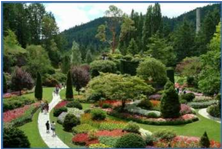
Butchart Gardens (40 min drive)