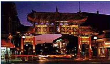
Historic China Town (15-20 min walk)

For more information on tourist attractions, Victoria climate and history please visit: http://www.victoria.ca/visitors/about.shtml