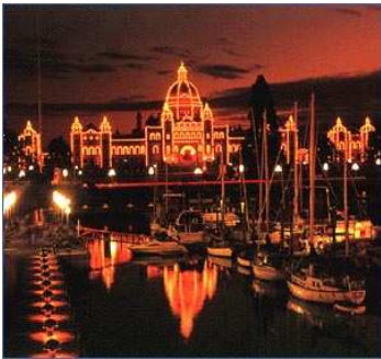
The Legislative Buildings (5 min walk)