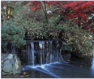
Beacon Hill Park (10-15 min walk)